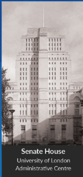
Senate House University of London Administrative Centre