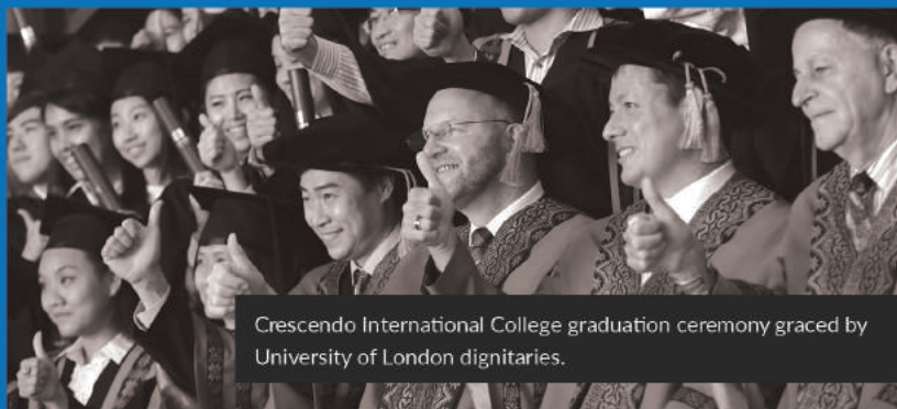
Crescendo International College graduation ceremony graced by University of London dignitaries.