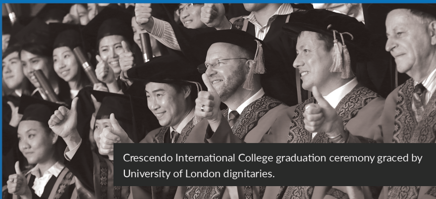
Crescendo International College graduation ceremony graced by University of London dignitaries.